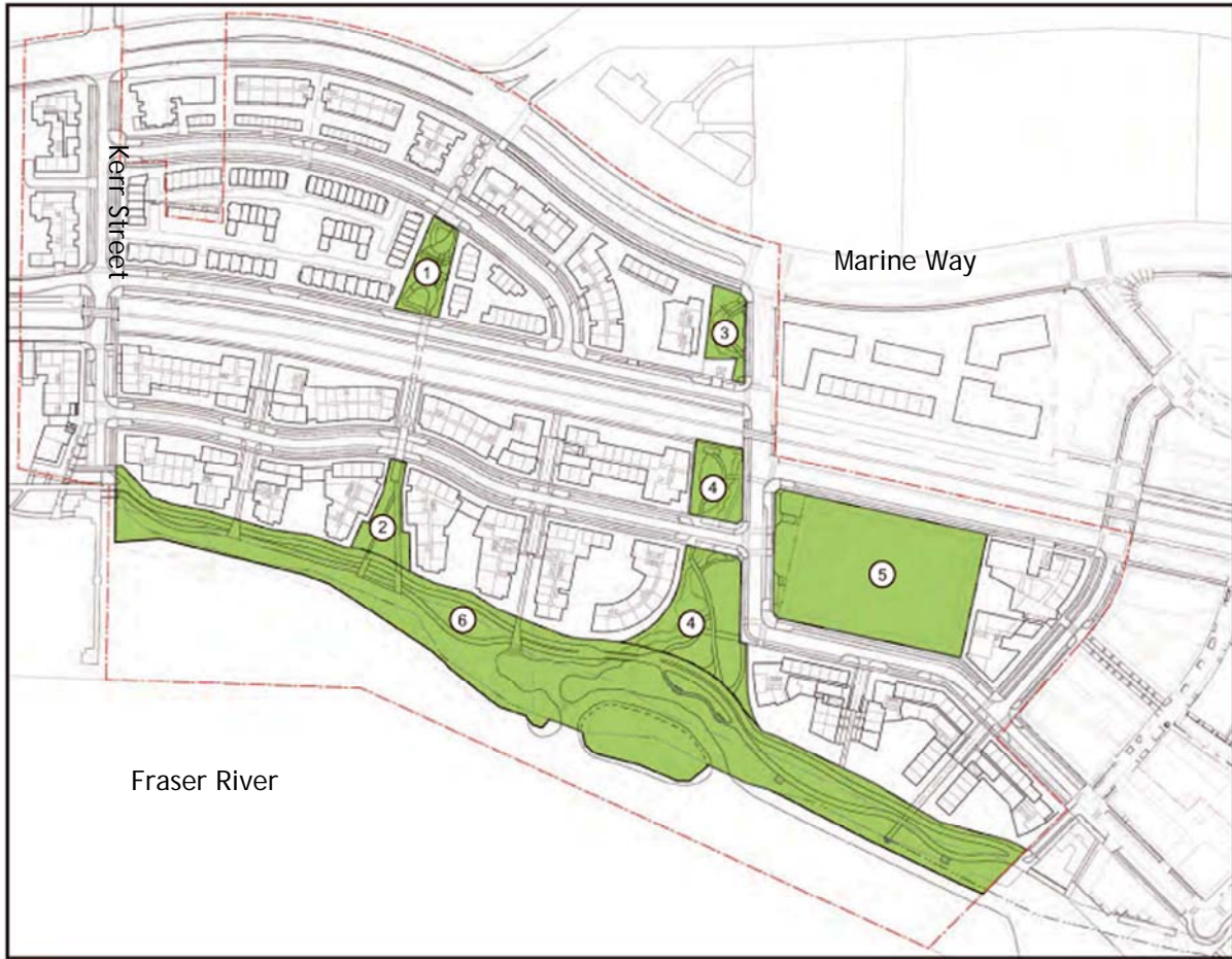
Parks Conceptual Diagram 1:3000